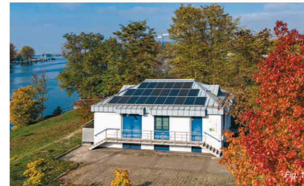
Building of the Rhine monitoring station directly on the Rhine