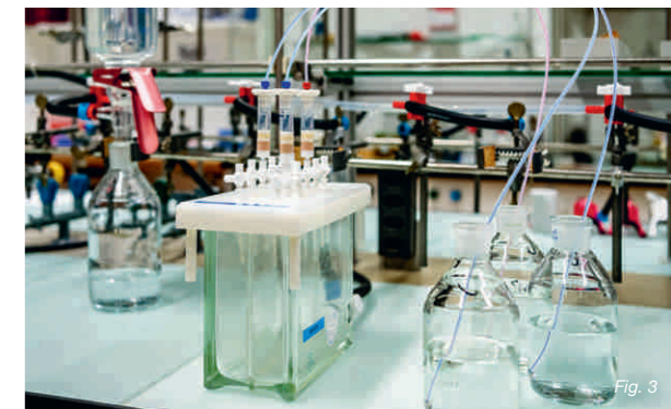
Water samples during analysis in the laboratory